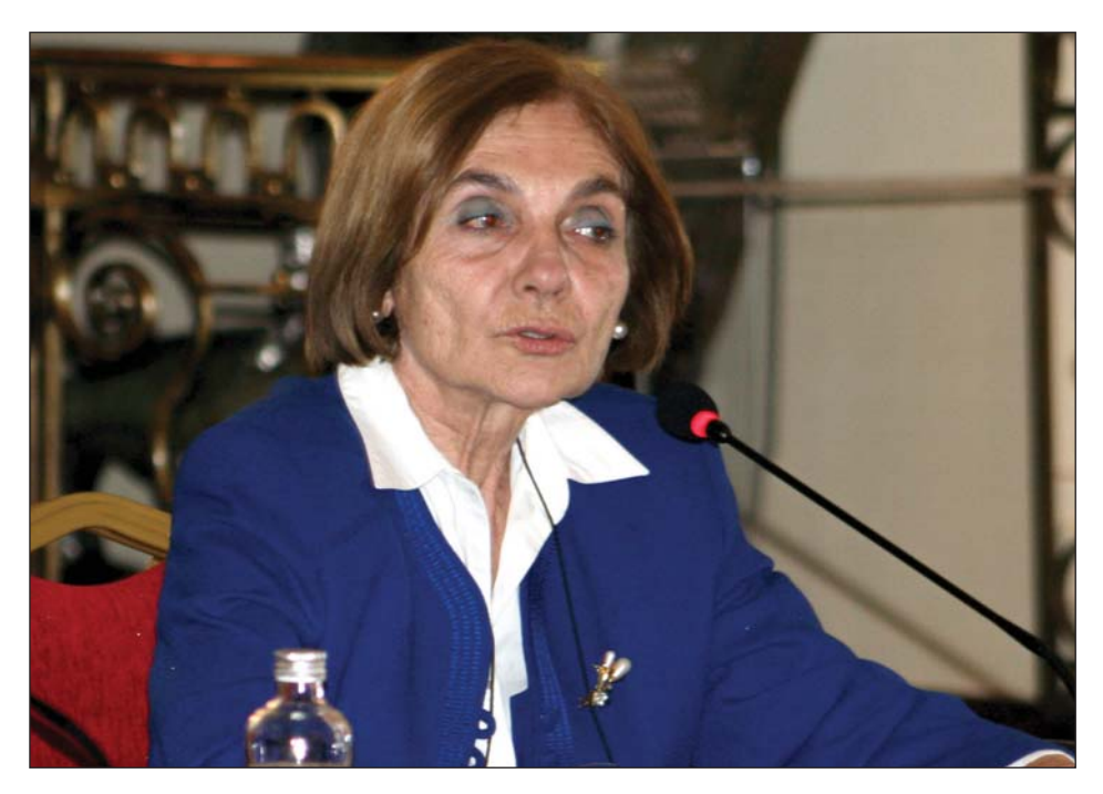
THE GENERAL HARBORD REPORT