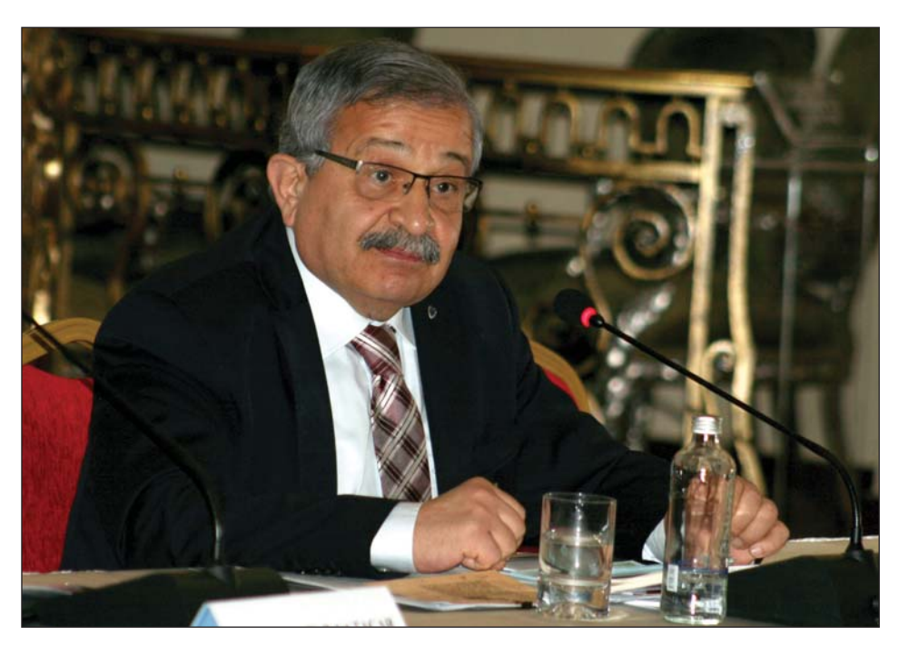
THE MALTA TRIBUNALS