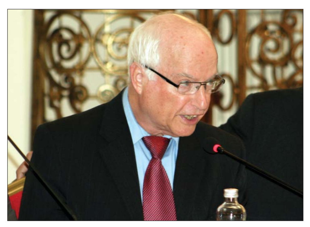
THE AMBIGUITY OF GENOCIDE