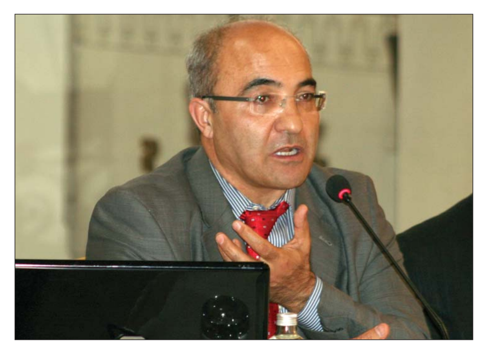
PAST TRAGEDIES AND THE PRESENT