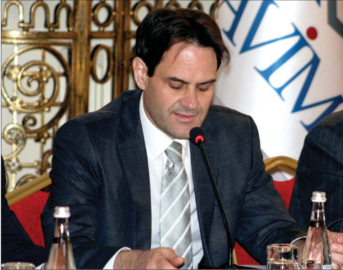
H.E. Goran TASKOVSKI Ambassador of Macedonia

ECONOMY IN THE REGION – economic prosperity and stability as a measure for political and ethnic cohesion, cooperation and understanding