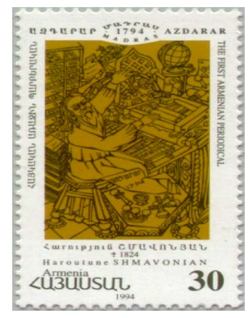
Special postal stamp on celebrating the 200th anniversary of the publication of Azdarar