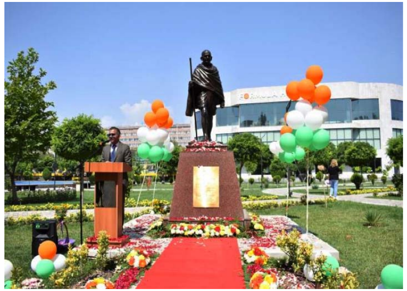
A photograph from the opening ceremony for the Mahatma Gandhi statue in Yerevan<sup>57</sup>