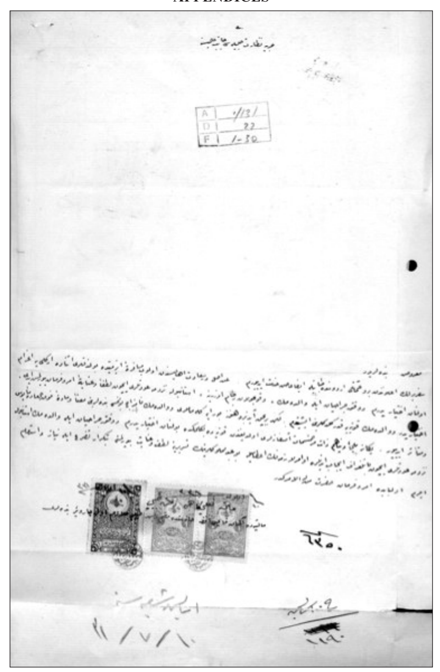
Appendix 1: Lieutenant Dentist Baruyir's Application