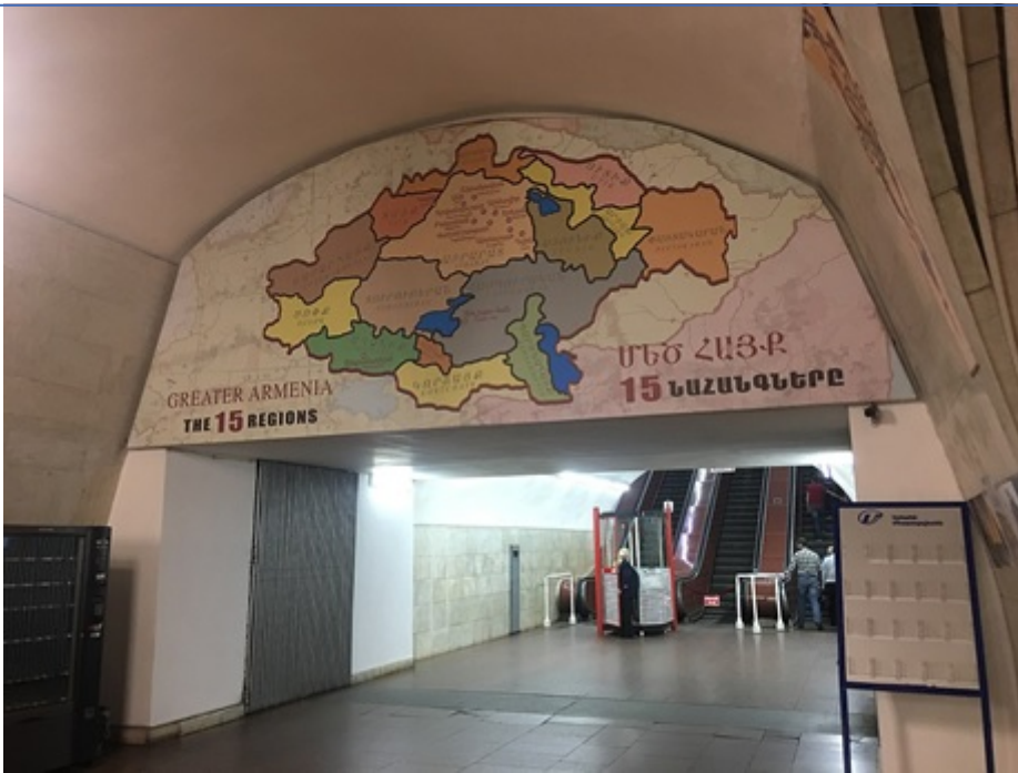
A map in a Yerevan metro station, displaying the territories of Azerbaijan, Turkey, Georgia, and Iran as part of a Great Armenia.