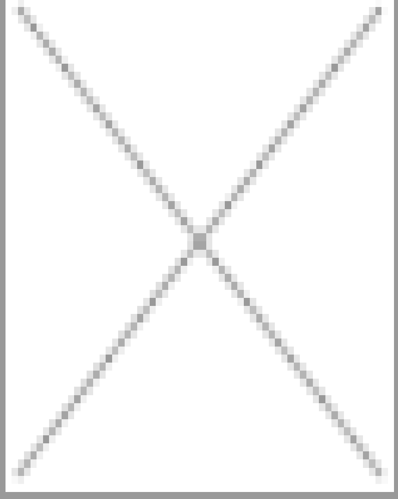
The photo of the Soghomon Tehlirian statue in Armenia-Maralik shared by Turkish media